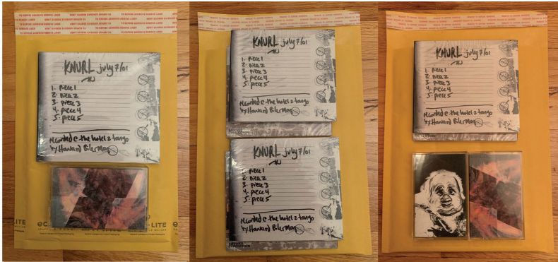
1 tape + 1 CD, 6x10" mailer

*Things will move around in transit, and what may be stacked nicely when first shipping out will likely turn into an oversized jumble by the time it hits the sorting facility and could be returned to you. When placing CDs side by side it's best to also insert a piece of cardboard to keep the package flat and prevent this kind of slippage.