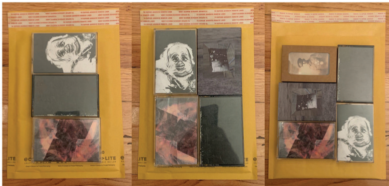
3 tapes in 6x10" mailer

Pick a suitable mailer. Standard 6x10" bubble mailers can hold 1-3 tapes (sometimes 4 if the internal width is on your side). 8x12" bubble mailers can hold 4-5 tapes. See examples below.